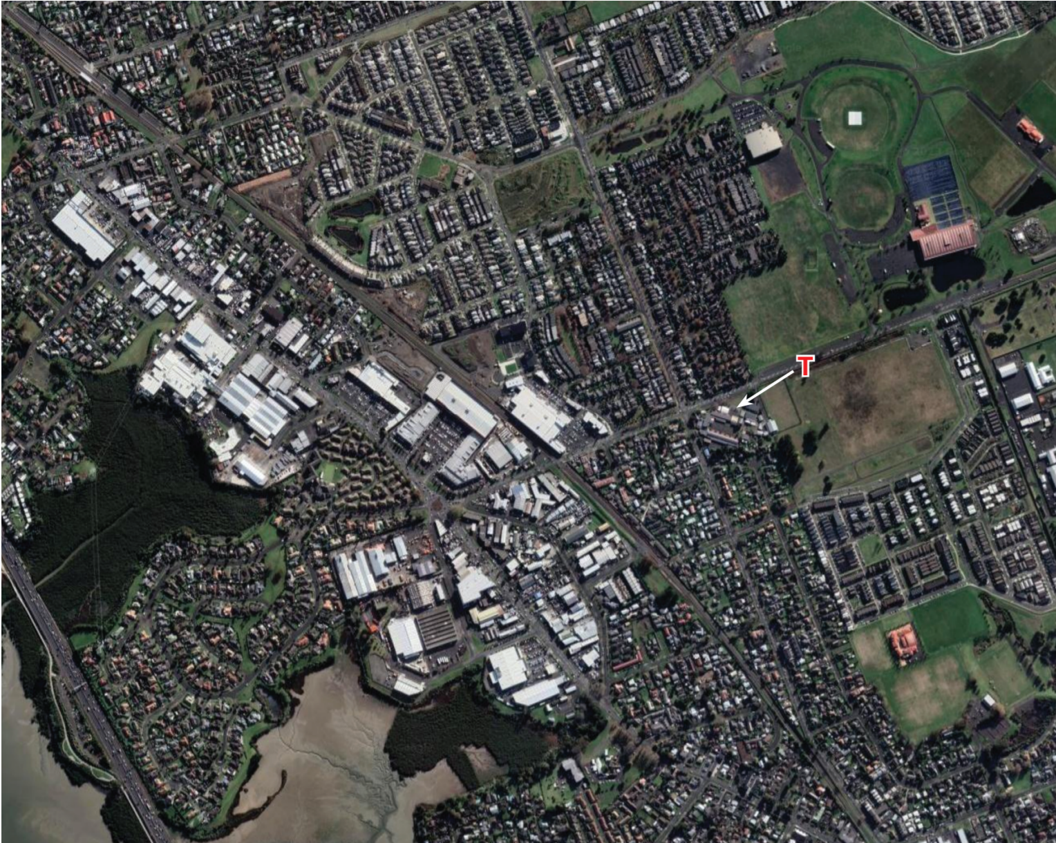
Satellite image of Box C on topographic map (area references 7097, 7197, 7297, 7098, 7198, and 7298)