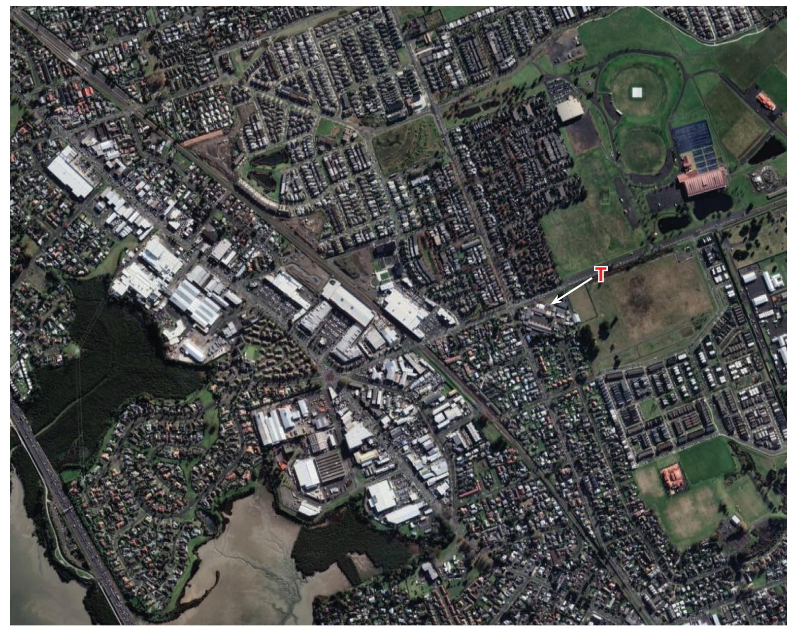
Satellite image of Box C on topographic map (area references 7097, 7197, 7297, 7098, 7198, and 7298)